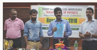
Release of manuscript