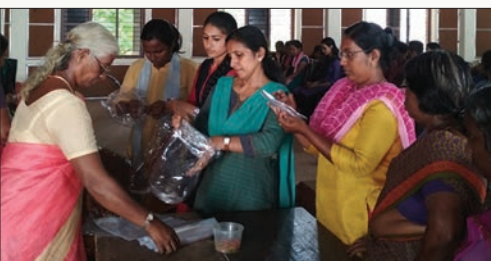
Participants getting hands-on training in Mushroom cultivation.

A training on Mushroom cultivation and marketing was conducted in the College auditorium on 24 th January, 2020 in association with the Department of Zoology. The programme aimed to attract