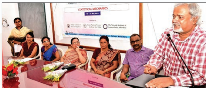
Inaugural Function of the Refresher Course