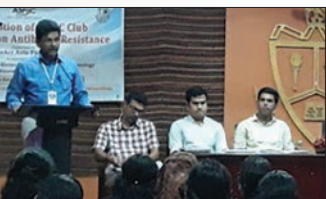
Inauguration of ASPIC Club

for a field trip. In the afternoon, a short film "Forest and Wildlife" was screened.