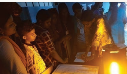
Hands on session of Shasthrajalakam