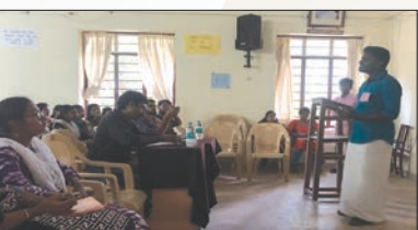
Inter Departmental Teaching Competition