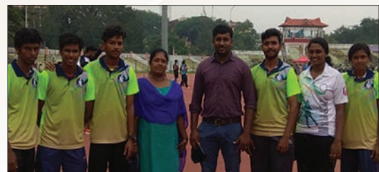
Bishop Moore College Athletic team participated in the march past ceremony of the University of Kerala, Annual Athletic meet 2018-2019