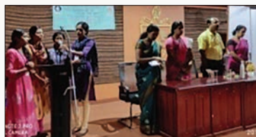
Inaugural Ceremony of World Environment Day celebrations