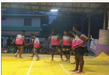
Bishop Moore College Kabadi (M) Team in action. Intercollegiate tournament organized by S N College Cherthala