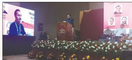
Kerala Legislative Assembly's 'Festival of Democracy'