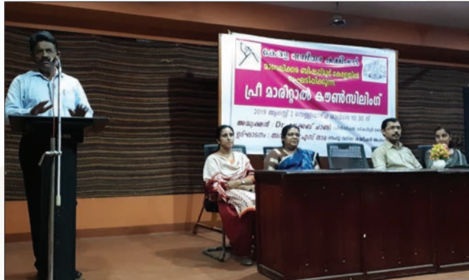
Pre-Marital Counselling and Seminar by Kerala State Vanitha Commission.