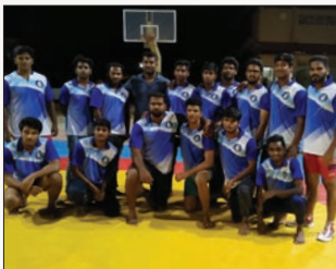
Runners in the Kerala University Judo (Men) intercollegiate championship held at central stadium 2018-2019.