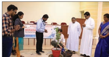
Inauguration of Bioradiance 2019

In association with Pushpagiri Research Centre, a National Conference BIORADIANCE 2019 “Toxicity and Current Perspectives” was organized on 5 th and 6 th July 2019.