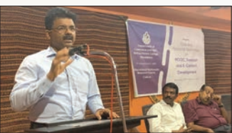
Principal inaugurates the Seminar on the 'Working of SWAYAM- the Indian MOOC'