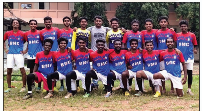
College Football team participated in the Kerala University intercollegiate championship held at TKMCE Kollam and St Aloysius College Edathuva.

Volleyball, Judo (men & women), Baseball, Wrestling (men & women), Basketball, Softball (men), Athletics, Chess (M&W), Power lifting, Best Physique,