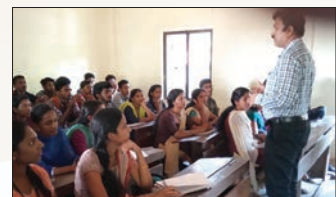
Career Orientation Programme

A one day career orientation programme was conducted for final semester B.Sc.Mathematics students on 19 th March 2019.