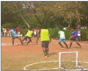
Interdepartmental Football Championship