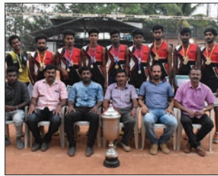
Winners in the All Kerala Intercollegiate Volleyball championship organized by TKM College of Engg. Kollam.