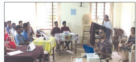
World Cup Football Quiz