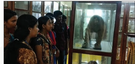
One Day Workshop for Gifted Children

and they also participated in mushroom cultivation training programme.