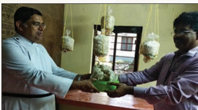
Installation and Harvesting of Mushroom