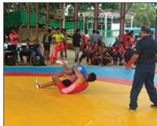
College wrestling team in action. Kerala University intercollegiate wrestling championship organized by university college Trivandrum.