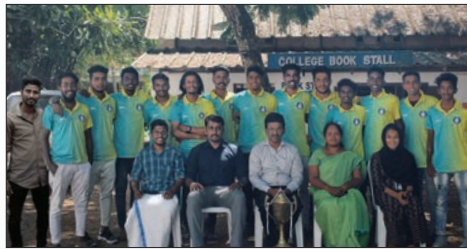
Winners in the Kerala University Baseball (Men) intercollegiate championship organized by Govt College, Attingal.