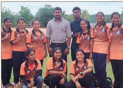
Third Position in the Kerala University Judo (Women) intercollegiate championship held at Govt. Agricultural College, Vellayani 2019-2020.