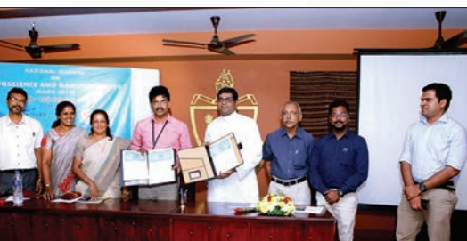
Signing of MoU

The Post Graduate and Research Department of Chemistry, Bishop Moore College, Mavelikara and Pushpagiri Research Centre Thiruvalla entered into a Memorandum of Understanding (MoU) for the development of scientific research programmes in the field of Bio-nanocomposites and biobased aerogels. The MoU was signed during the valedictory function of the three day National Seminar on Nanoscience and Nanotechnology on 14 th February 2019. This agreement between the two institutions will be a stepping stone towards the development of novel materials with biomedical applications.