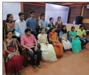
Winning Team with Faculty