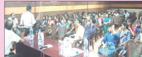
Talk on Digital Banking