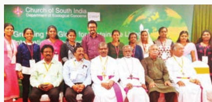
Bishop Moore College Team with the organizers of International Eco-conference.