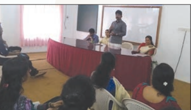
JAM Coaching Class