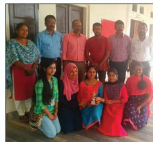
College softball team participated in the Kerala University intercollegiate championship held at university stadium.