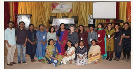
Prof. Laura Mulvey with the Post Graduate Students of the Department