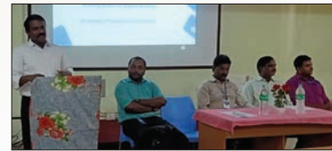
Talk on Security Issues in Digital Banking- Welcome speech