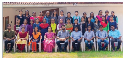
The Workshop Team

Three-day workshop on Foundations of Mathematics for B.Sc. second and final year students was organized from 27 to 29 May 2019. The workshop was handled by eminent college teachers in Kerala, and covered topics on fundamentals of higher Mathematics. The programme also created a