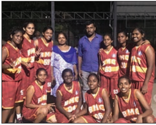
Runners in the Kerala University Basketball (Women) intercollegiate championship 2018-19 Organized by Mar Ivanious College Trivandrum.