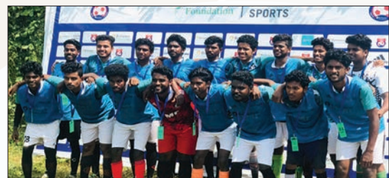
College Football team participated in the Kerala University intercollegiate championship held at TKMCE Kollam and Reliance Youth Football Championships at Kollam.