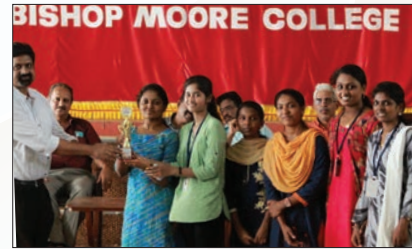
Second position in the Kerala University Chess (Women) Intercollegiate championship