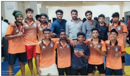
Winners in the Kerala University Judo (Men) intercollegiate championship held at Govt. Agricultural College, Vellayani 2019-2020. College wrestling team in action. Kerala University intercollegiate wrestling championship organized by University College, Thiruvananthapuram