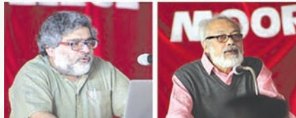
Resource Persons of the International Conference