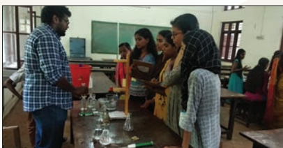
Shastra Jalakam 2019