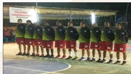
Runners in the Alapuzha District Basketball (Women) championship.