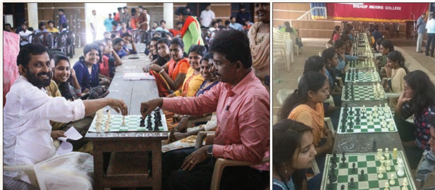
Bishop Moore College Organized the Kerala University Intercollegiate Chess (M&W) Championship at College Auditorium.