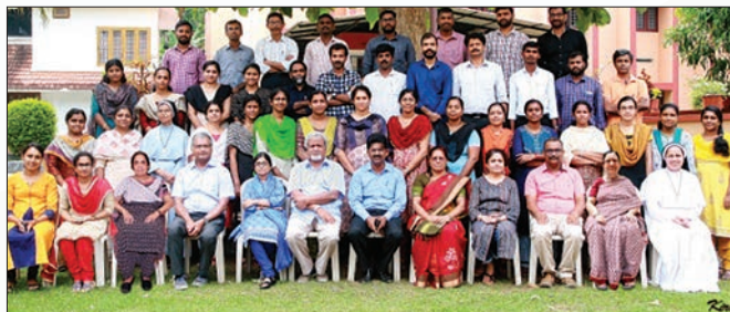
Participants of the Science Academies' Refresher Course in Statistical Mechanics