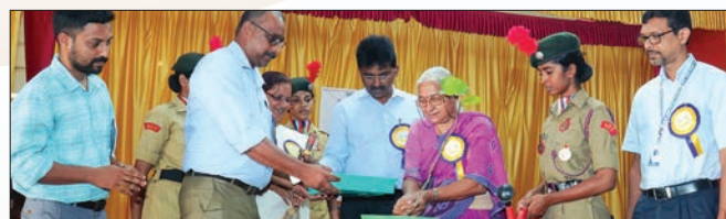
Medha Patkar Planting a Sapling