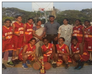
Winners in the All Kerala Intercollegiate Basketball (Women) championship organized by Mar Gregorius College Punnapra, Alapuzha.