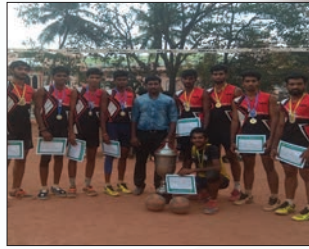
Winners in the Alapuzha District Junior Volleyball (Men) championship held at Cherthala.