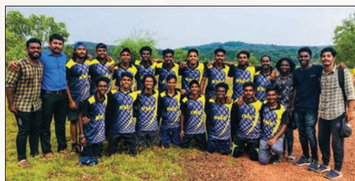
Bishop Moore college softball team participated in the Kerala university intercollegiate softball championship held at NSS College, Nilamel.