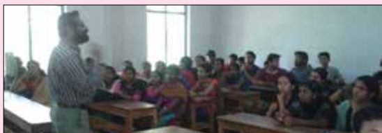
Training program for Competitive examinations

A training program on Competitive Exams and Career Opportunities in Banks was conducted on 8th December, 2015 and 17th March 2016