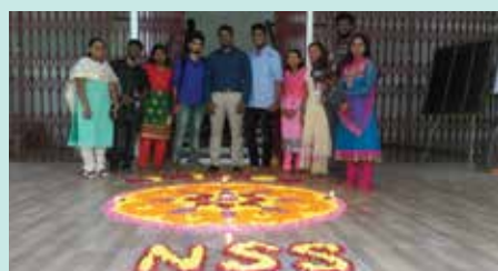
Athapookalam by NSS