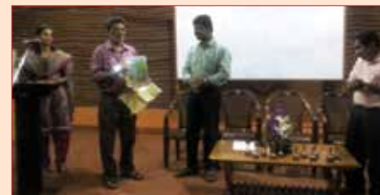
Release of Manuscript "Haritha Spandhanam"

The Valedictory function of the club was held on 13th June, 2016. 'Haritha Spandhanam' the manuscript prepared by club members was released in this function by the Principal. The winners of various competitions conducted by Nature club were honoured with trophies in this programme.