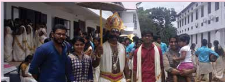
Alumni interacting with the present students during Onam-2016

The Department Alumni meet was held on 24th December 2016.