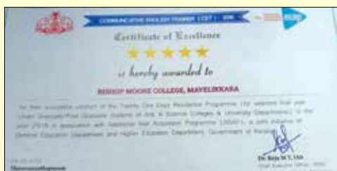
Five Star Achievement