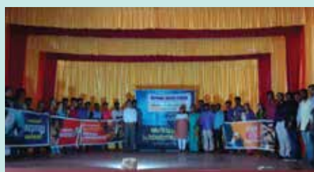
Anti Drug Campaign