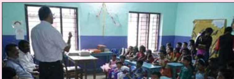
Distribution of Study Material to School Students

Every year the Department selects a school and extends financial support to that school according to the need of the students. In June 2016 the second year students donated study material worth Rs. 4500 to a Lower Primary School in the vicinity.