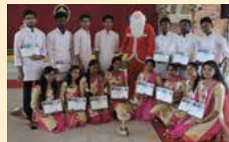
Winners of Intercollegiate Carol Completion