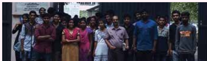
Industrial Visit 2016

Industrial Visit - The final year students of 2013 batch visited Hindustan News Print Ltd Vellor on 11th October 2015 and the 2014 batch students visited Hindustan News Print Ltd on 24th September 2016.