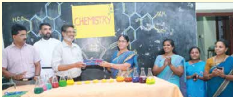
Exhibition Inauguration - Atomia -2016

The Department organized an exhibition "ATOMIA-2016" on 28 th October 2016 as a part of the "International Mole Day" celebrations. A book on "Nobel Laureates in Chemistry (1901-2016)" and a revised "Lab Manual" were published by the Department during the inaugural function of ATOMIA 2016 .