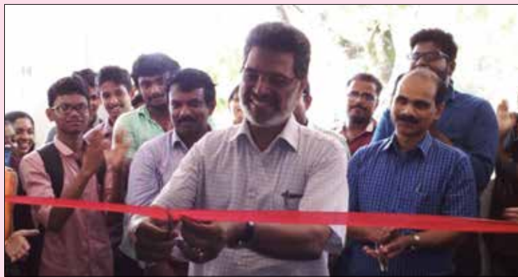
The Principal Inaugurating the Exhibition

Commerce Exhibition which showcases different still and working models was organised on 11th October 2016.