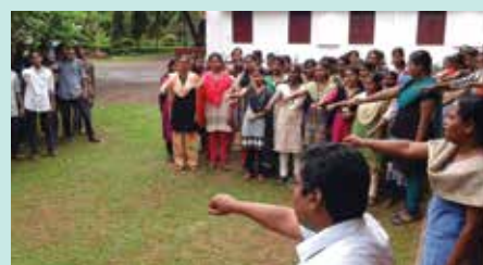
Pledge to Protect the Environment