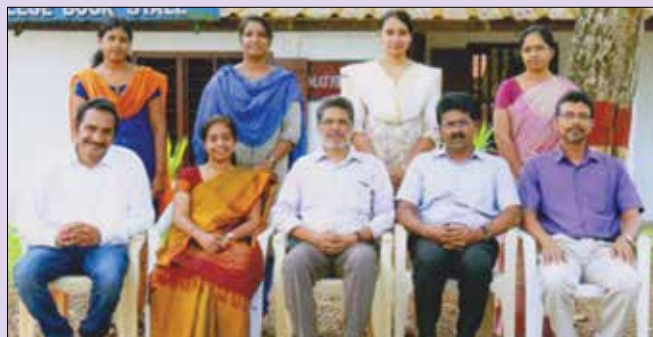
NAAC Steering Committee

One day workshop on Malayalam Wikipedia (promoting Malayalam edition of Wikipedia) was conducted under the auspices of IQAC on 30 August 2016. The workshop provided hands on experience to students to work online and trained them to become wikis. The participants created articles and submitted them online.