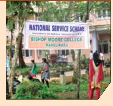
Cleaning of the Court Premises