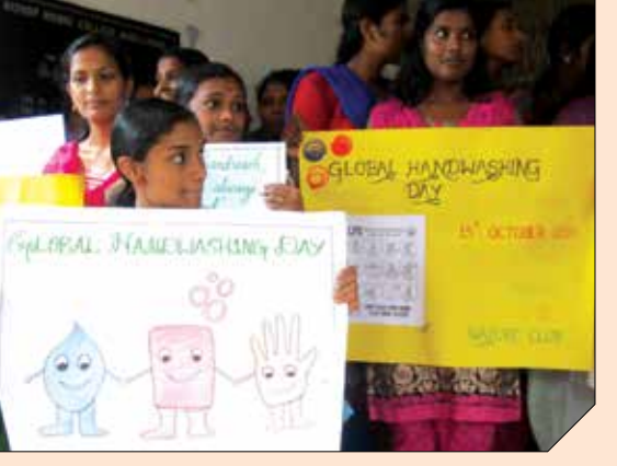
Global Hand washing Day Celebrations