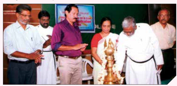
Inauguration of B.Com Computer applications course

New Course: B.Com (with elective Computer Application) was started during this academic year.