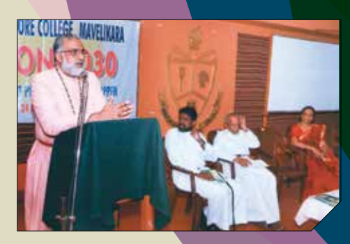
Bishop addressing the audience on the topic 'Vision 2030'