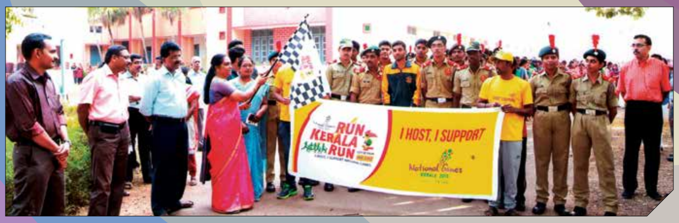
Principal flagging off Run Kerala Run supporting the National Games hosted by Kerala