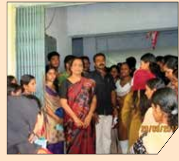
Cleaning of the Men's Hostel