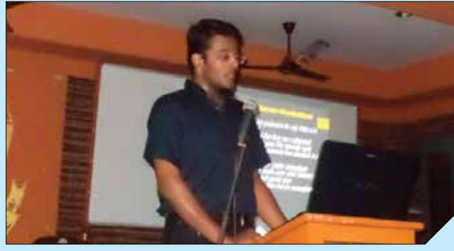
Powerpoint Presentation Competition

As part of Ozone Day Celebrations, Resonance conducted a Powerpoint Presentation Competition on 17th September 2014 for the students of the College. Students from all the departments of the College participated