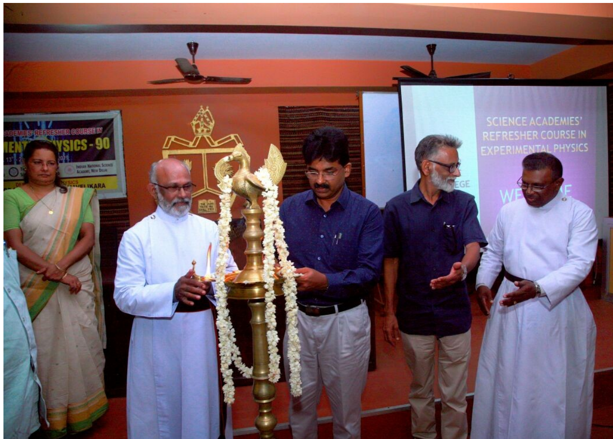
Refresher Course in Experimental Physics: 13-28 Sep 2017