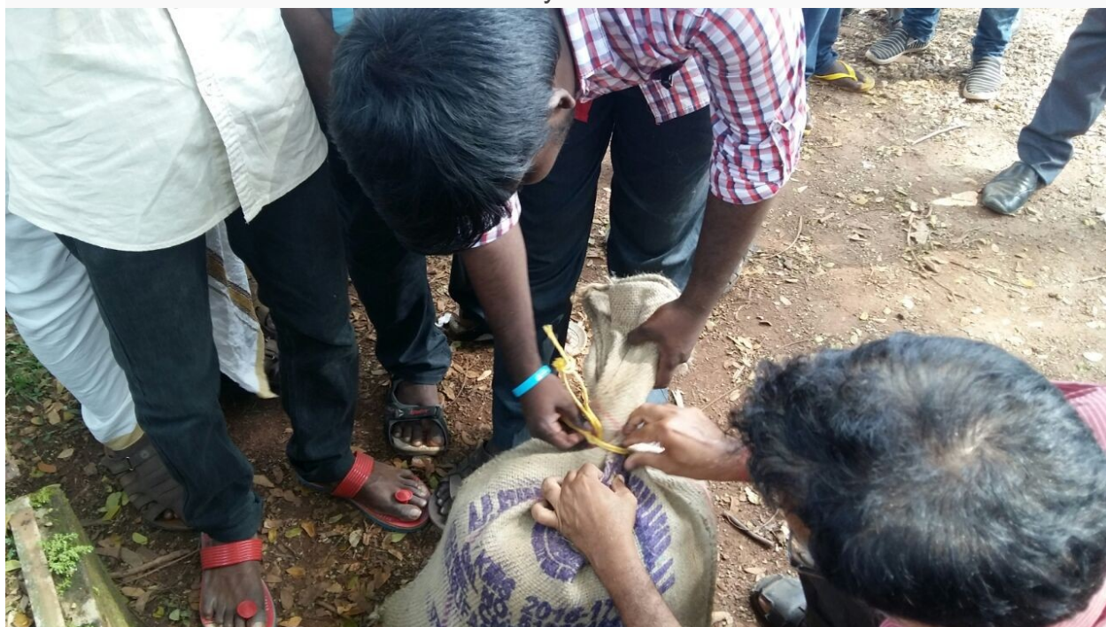
16 Nov 2017: Paddy seeds for cultivation