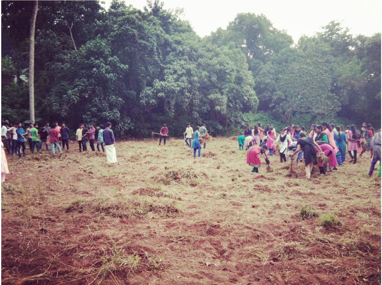
29 Oct 2017: Students' at work.....