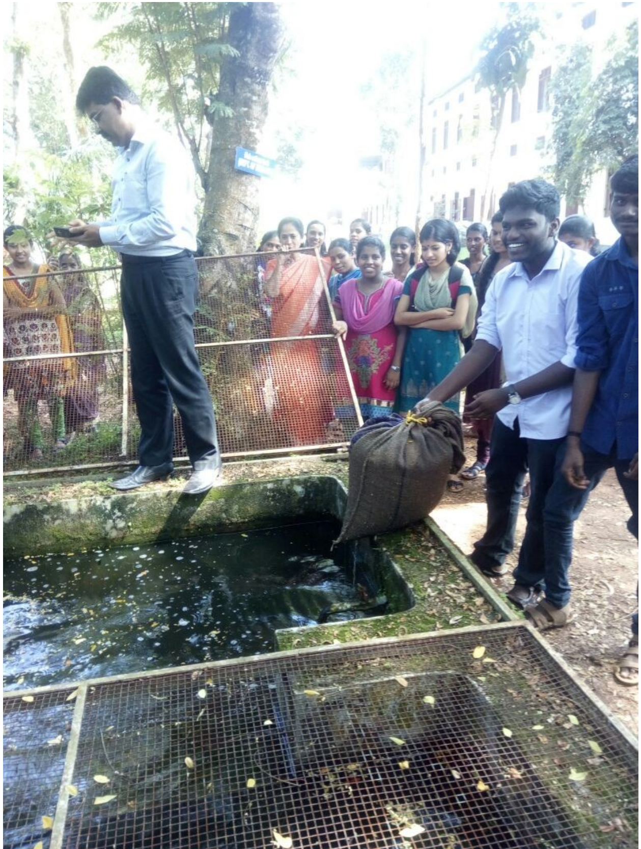
16 Nov 2017: Soaking paddy seeds