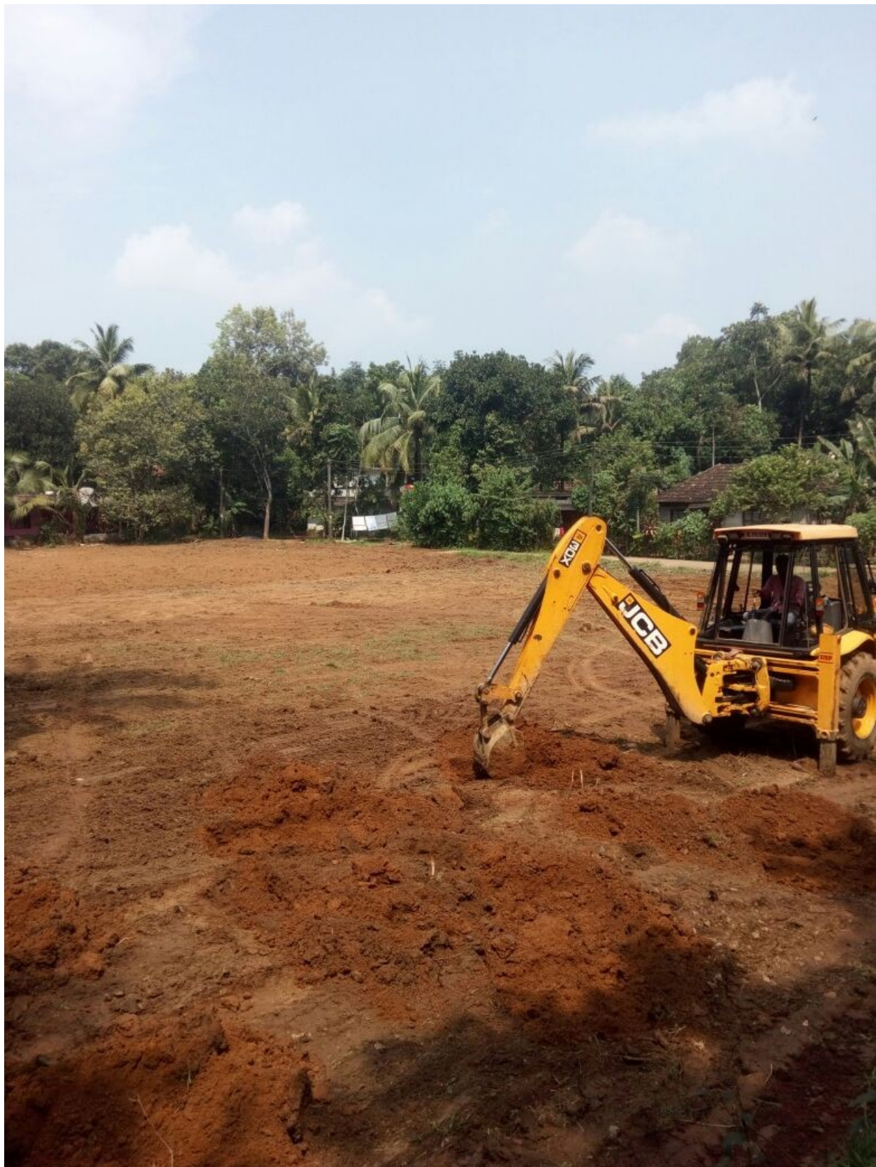
13 November 2017: Land getting ready for cultivation