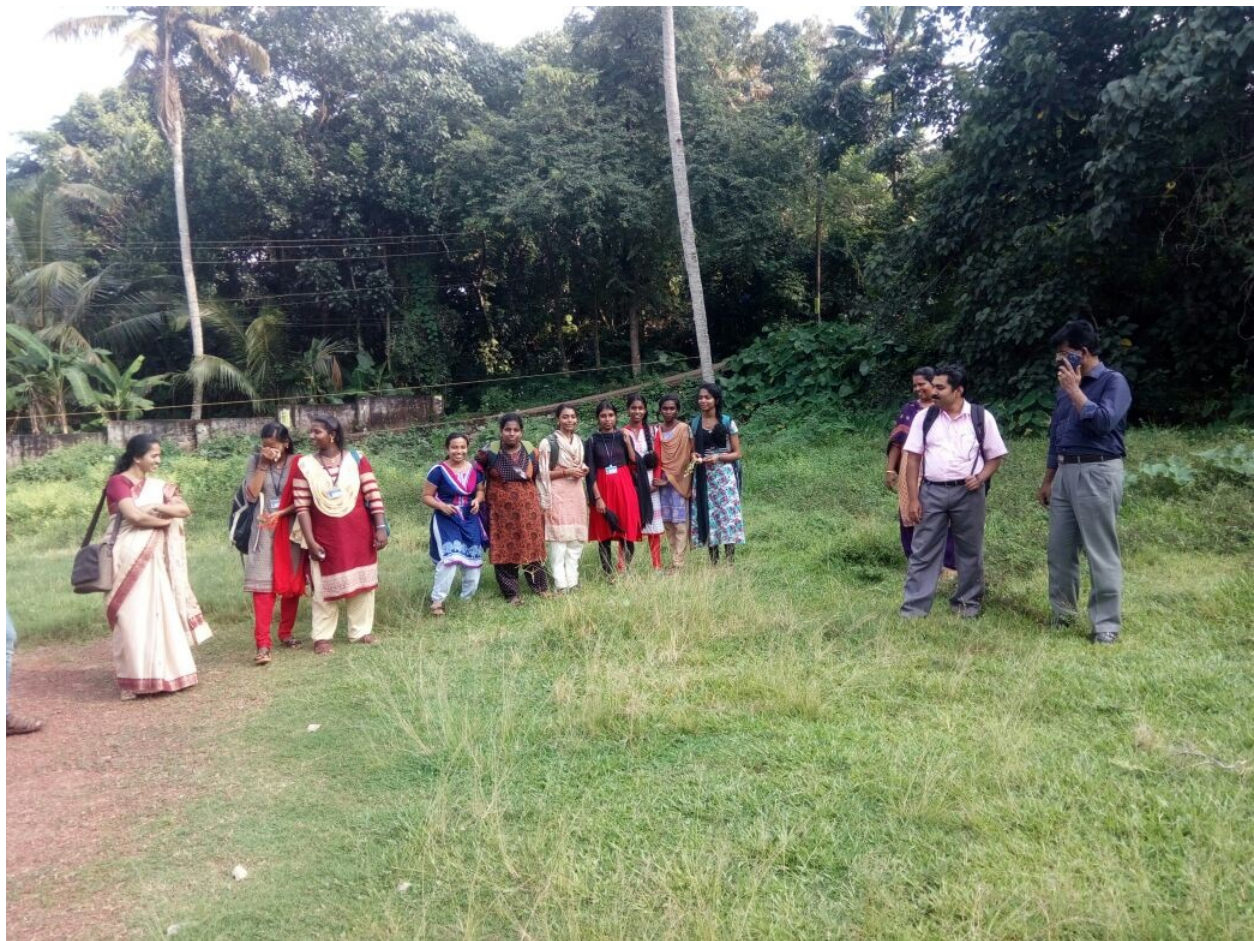
10 Oct 2017: Students & Teachers visit the site