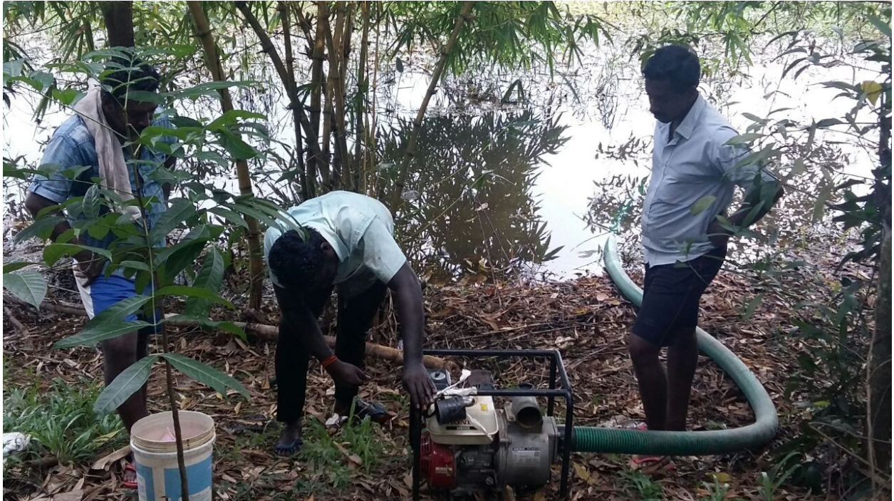
nov 18: Effort to pump water to paddy field