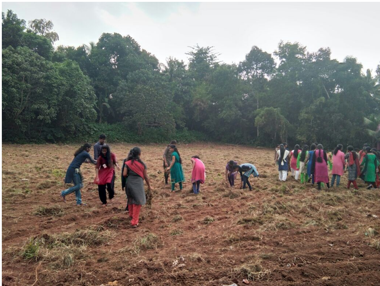
29 Oct 2017: Students at work