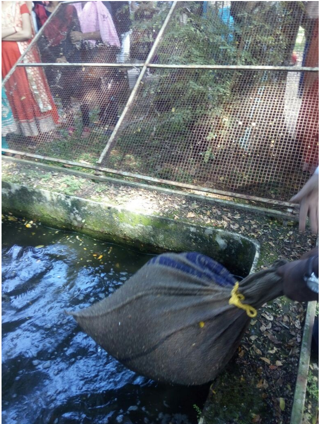
16 Nov 2017: Soaking paddy seeds