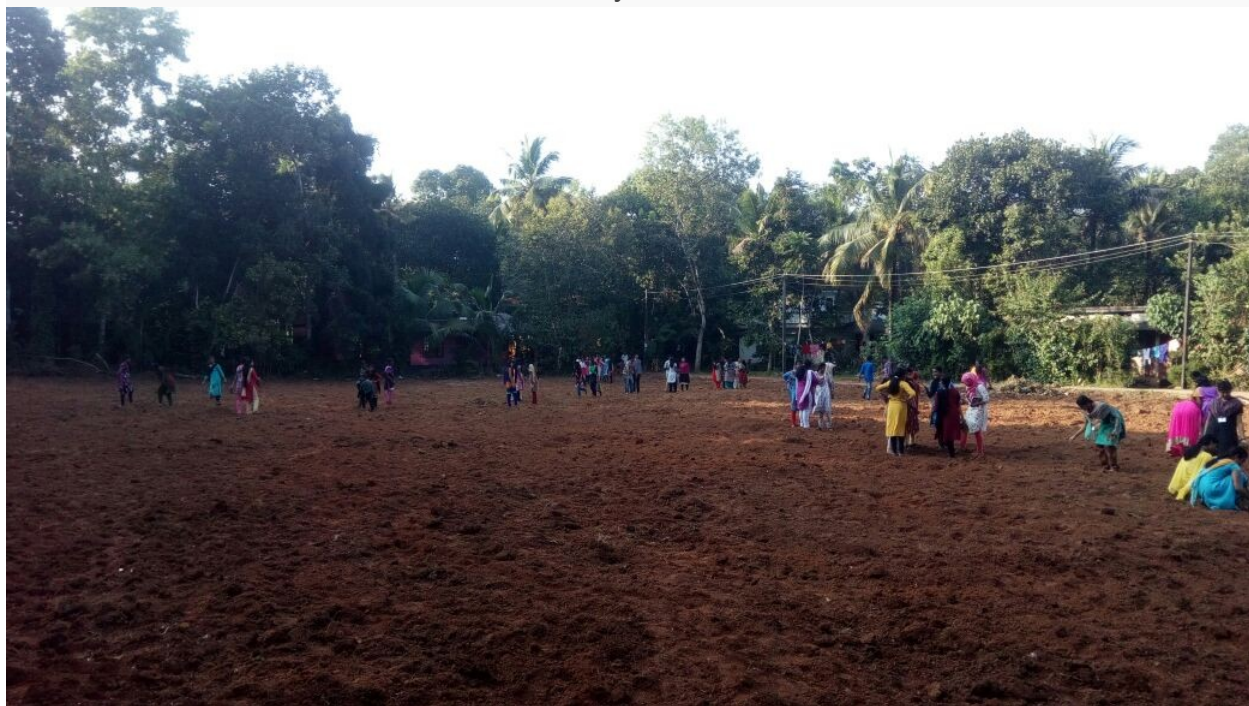
15 November 2017: Students' at work.....