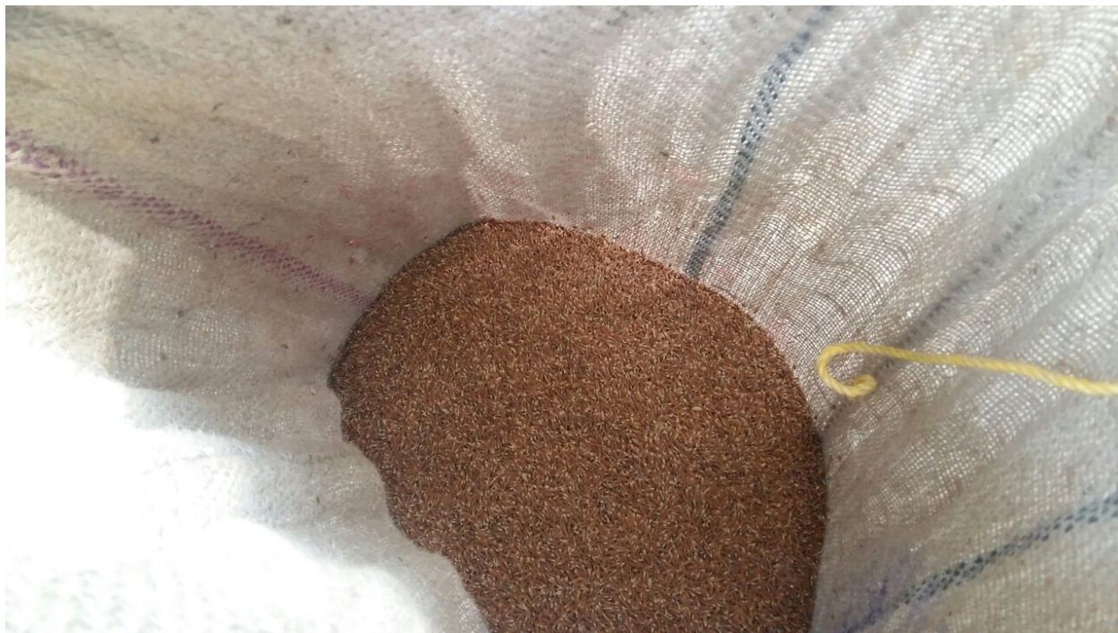
16 Nov 2017: Paddy seeds for cultivation