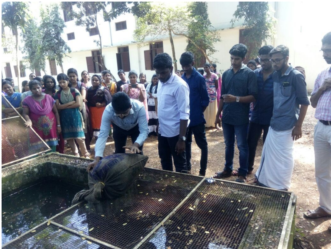
16 Nov 2017: Soaking paddy seeds