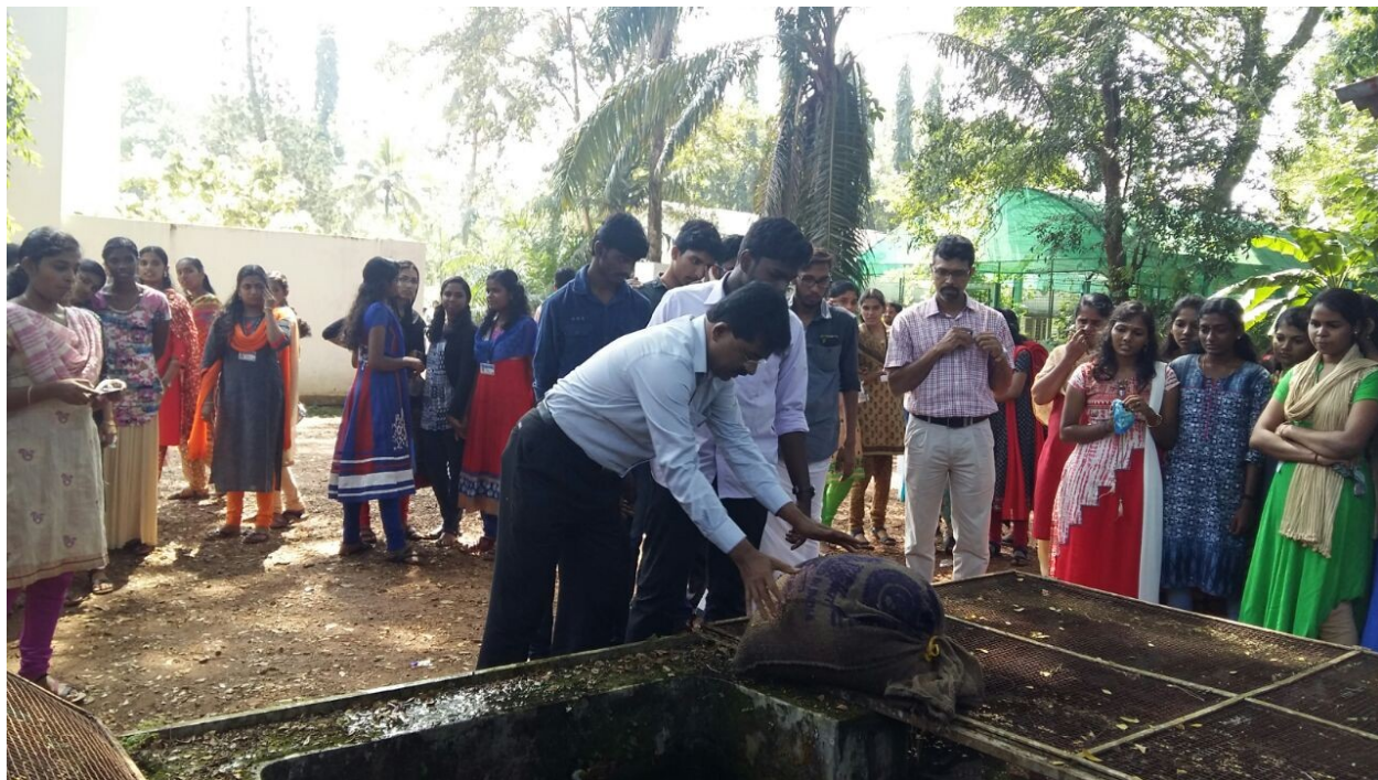
16 Nov 2017: Soaking paddy seeds