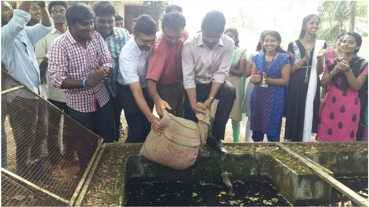
16 Nov 2017: Soaking paddy seeds