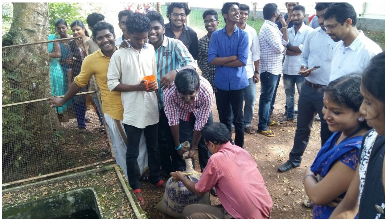
16 Nov 2017: Paddy seeds for cultivation